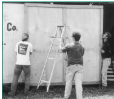
Rebuilding the carport door.