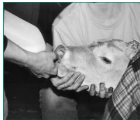
Calf receives care at the Perkiomenville Shelter.

Late that day, the grateful owner claimed his revived calf from our Perkiomenville Shelter. With the calls from concerned people and with our staff's rescue and care responses, the calf received a new lease on life on that first day of May, 2009!