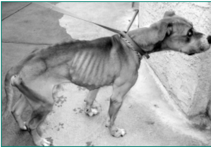
When we got the dog.