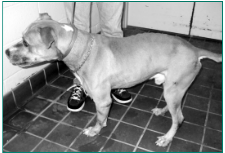
After a few weeks in our care.