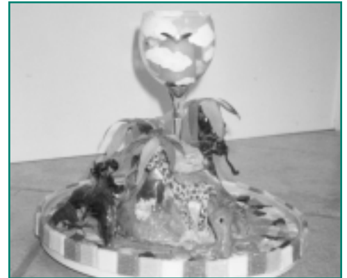
Sarah's glass design.