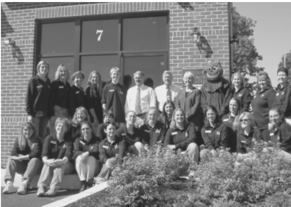
Trooper Veterinary Hospital Staff